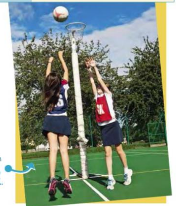
Netball team in Bradford, Yorkshire, UK.